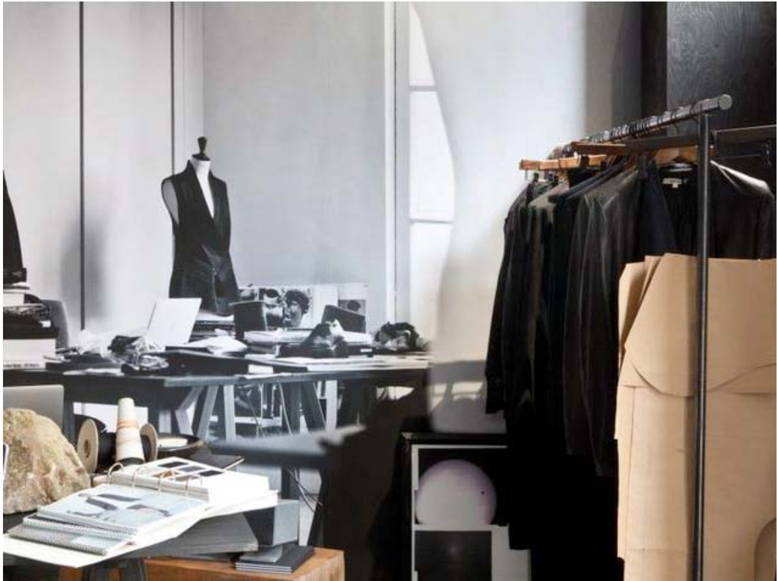
L'Atelier Damir Doma